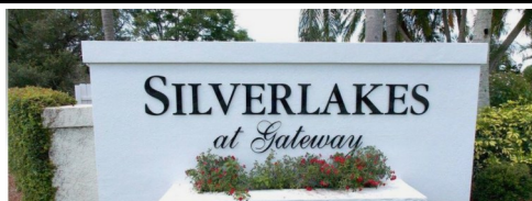
Silverlakes at Gateway